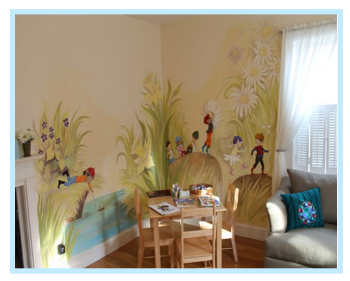
Family Waiting Room at the CAC