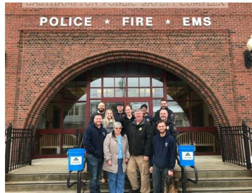
Sand For Seniors Distribution, Easthampton