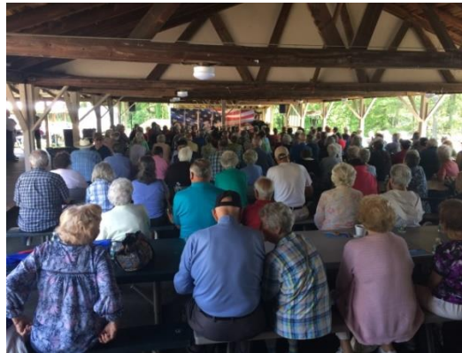
2018 TRIAD Summer Picnic, Gill