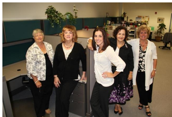
Franklin County Victim-Witness Advocates

During 2011, the Safe Schools Response Team reviewed 16 referrals and complaints.