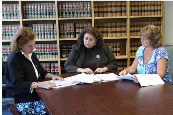
Child Abuse Unit staff members

2011 was a busy year for the CAU. There were 316 cases referred to the Child Abuse Unit for investigation, which translates into almost a new case each day of the year. Of these 316 referrals, 132 cases were charged.