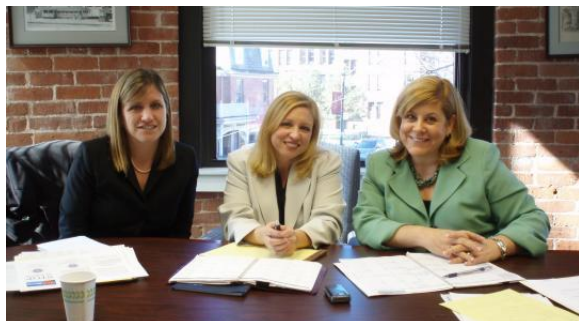
The Juvenile Justice Unit

program targeting juveniles, and the Safe School Response Team, designed to oversee and aid schools in their investigations of threats, bullying incidents, and other unsafe behaviors.