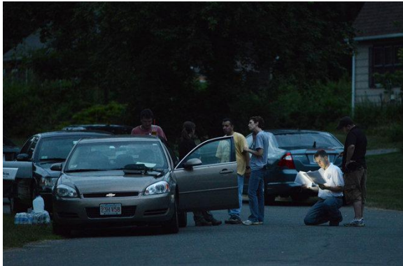
Massachusetts State Police detectives assigned to the NWDAO at a crime scene with prosecutors

All unattended deaths in Franklin and Hampshire counties and the town of Athol are investigated by SPDU.