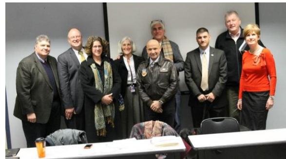
Veterans Justice Partnership members