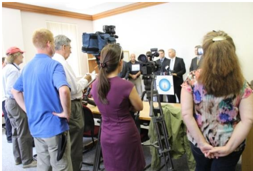
NWDA press conference

the NWDA website, NorthwesternDA.org , to a new level. It provides information about the many services offered by the NWDAO, as well as resources and updates about cases being prosecuted by our office and outreach events. As an ever-expanding archive of the office's many brochures and educational materials, it has become a key resource for our community partners and the public.