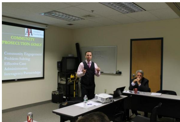
National presenters on Community Prosecution

The Law Enforcement Assistance Program (LEAP) has conducted trainings and provided assistance for law enforcement agencies throughout the Northwestern District. Law enforcement and prosecutor trainers have collaborated with the Communications and IT units to create video trainings for local law