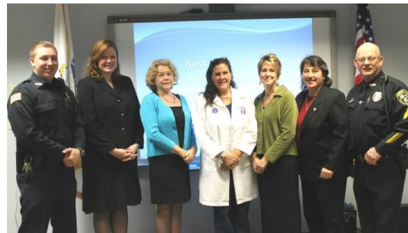
Sexual Assault Response Training team

the SART, which includes representatives of: Law Enforcement, Health Care, Forensic Sexual Assault Nurse Examiners, Prosecutors, Victim/Survivor Advocates. The Hampshire County SART reviews best practice models in responding to sexual assault that are victim centered and increase the chances of effective prosecution. SART members share these models within their own department and develop and implement cross training opportunities.