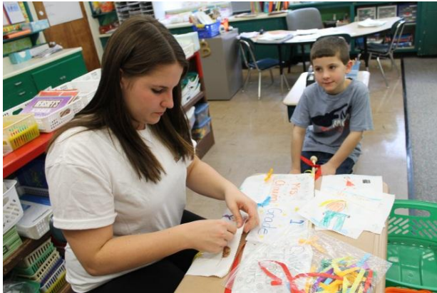
A Youth Advisory Board member and young student

opportunity for community building. It brings local high school students back into their elementary schools to teach the younger members of their community, and it reinforces the same key issues in the lives of the high school students.