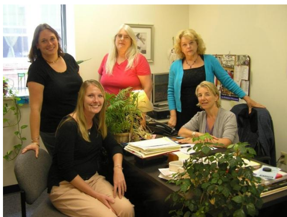
Domestic Violence and Sexual Assault Unit staff

In addition to prosecution, the unit coordinates numerous prevention and intervention initiatives aimed at strengthening victim safety and offender accountability. The unit also facilitates a task force of over 100 community and law enforcement members and DV roundtables in each of the four courts in the district.