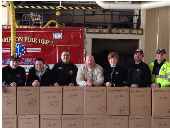
Easthampton Take Back volunteers