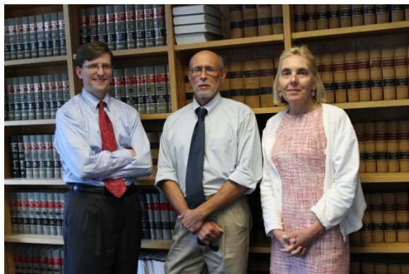
The Appellate Unit

The NWDAO also prevailed in a case ( Commonwealth v. Spencer Shangkuan ) that established that a completed return of service for a restraining order is admissible at trial without live testimony.