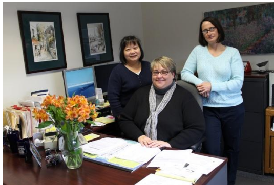
The Fiscal Unit